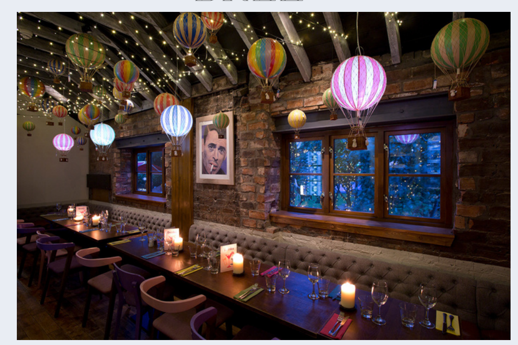
Cozy west-end bar with outdoor area