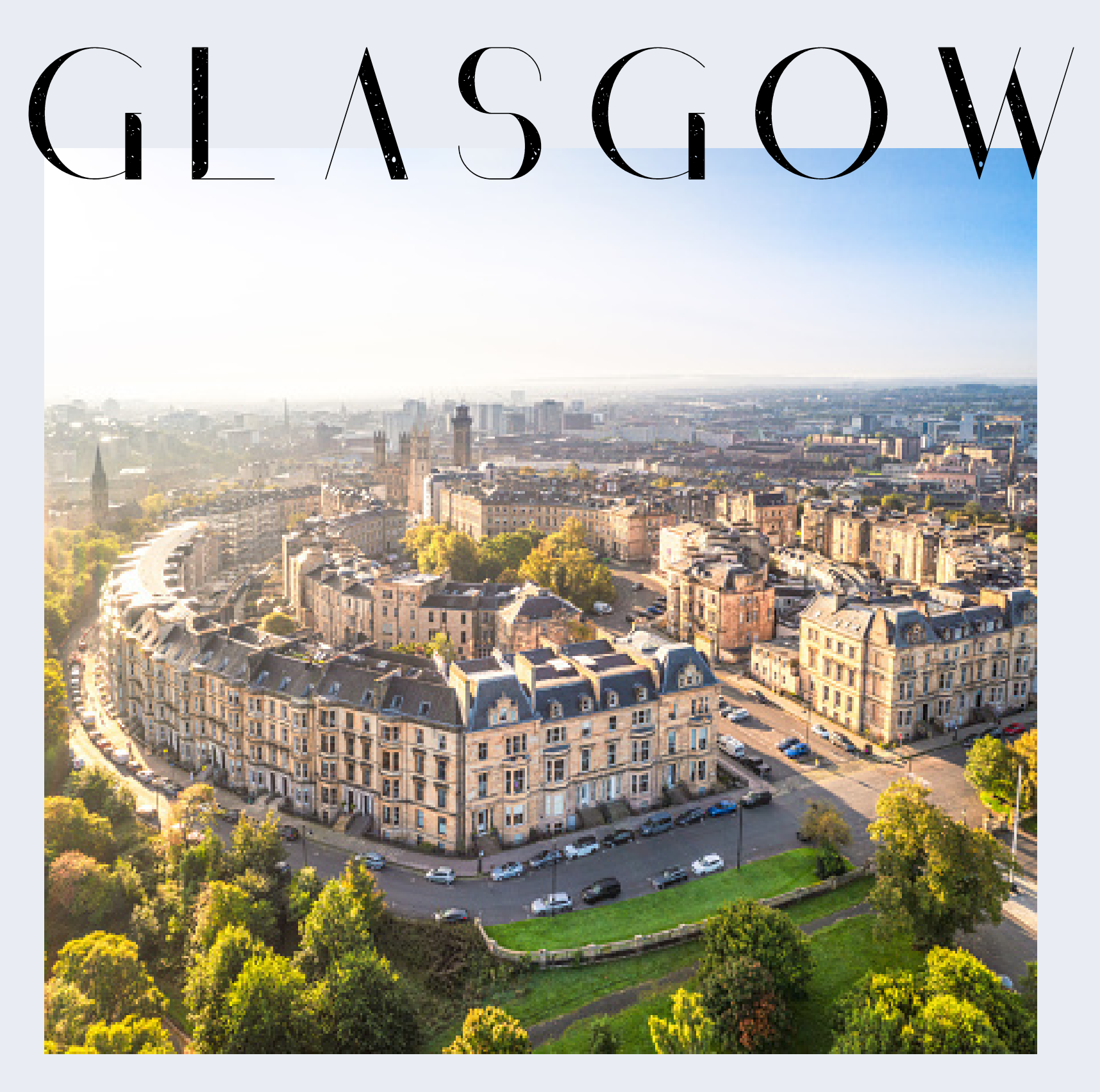
'THE PEOPLE MAKE GLASGOW' IS OUR MOTTO - COME SEE WHAT WE MEAN!

Known as one of the friendliest cities in the world, a pint and patter at a traditional Scottish pub can't be beat.